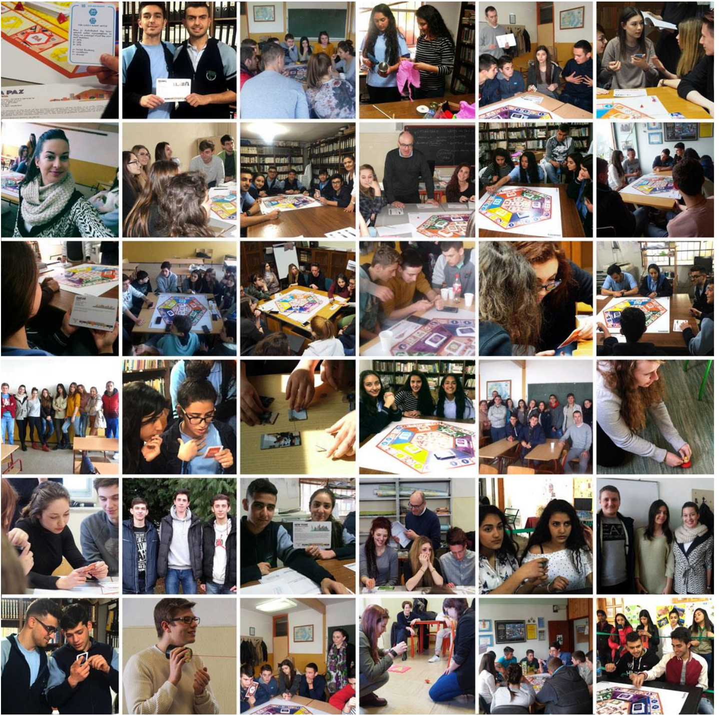
Kallipoly Competition