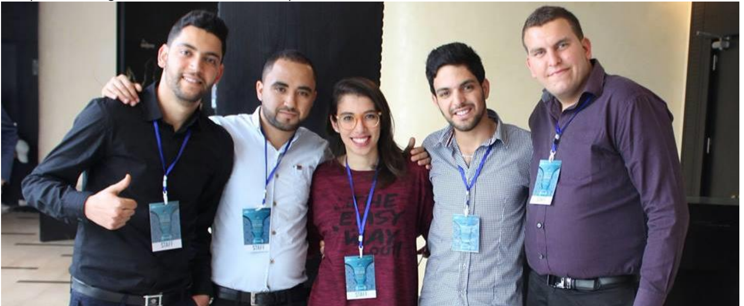
PolyExpo, organizers

The event included various intercultural activities, among them an Intercultural Fair, where each participant was invited to present their country and culture. Evenings saw artistic programs, acquainting the audience with the cultural and artistic wealth of Tunisia and its different regions through its costumes and culinary art. Finally, a Tunisian cultural tour that passes through Kairouan and Sousse took place.