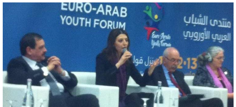
Amb. Hatem Atallah, Ms. Faten Kailel, Secretary of State, Ministry of Youth and Sports

The Forum opened with a plenary session, where five honorable speakers presented their approaches regarding culture as a bulwark of modern times in the face of violence and radicalization. The plenary session was followed by workshops and debates around the following themes: culture against violence in the public space, culture vs radicalization and culture as a tool of integration of migrants in host countries. The workshops aimed at providing Youth with tools for developing common intercultural projects.