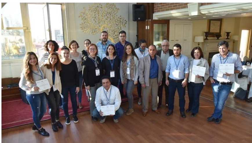
One of the 3 ALF coordinators of the Turkish Network, the Third Sector