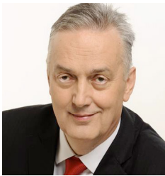
Zlatko Lagumdžija Former Prime Minister of Bosnia and Herzegovina and founder of the Shared Societies and Values Sarajevo Foundation