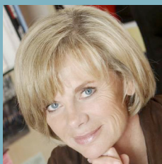
Élisabeth Guigou President of the Anna Lindh Foundation