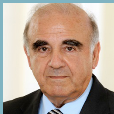
George Vella Minister for Foreign Affairs of Malta