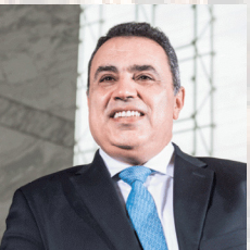
Mehdi Jomaa World Leadership Alliance Club de Madrid and co-chair of the Community for Democracy's new Security Dialogue