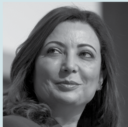
Wided Bouchamaoui Winner of the Nobel Peace Prize with the Tunisian "Dialogue Quartet" and confirmed speaker at MED FORUM 2016

"Now is the time for dialogue. Investing in the next generation of dialogue leaders is the best way to fight forces fueling polarisation and extremism."