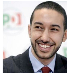
Khalid Chaouki Italian Chamber of Deputies on the Foreign Affairs Committee and Chair of the Culture Committee for the UfM Parliamentary Assembly