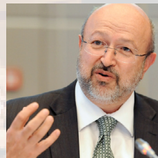
Lamberto Zannier Secretary-General of the Organisation for Security and Cooperation in Europe (OSCE)